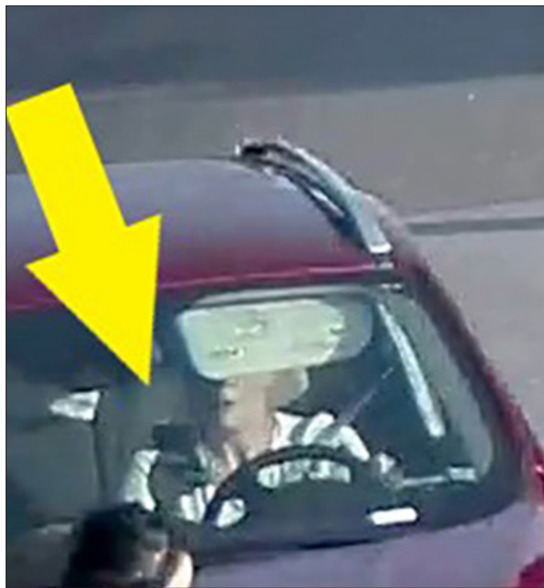
Zoomed in screenshot showing the driver was on her cell phone