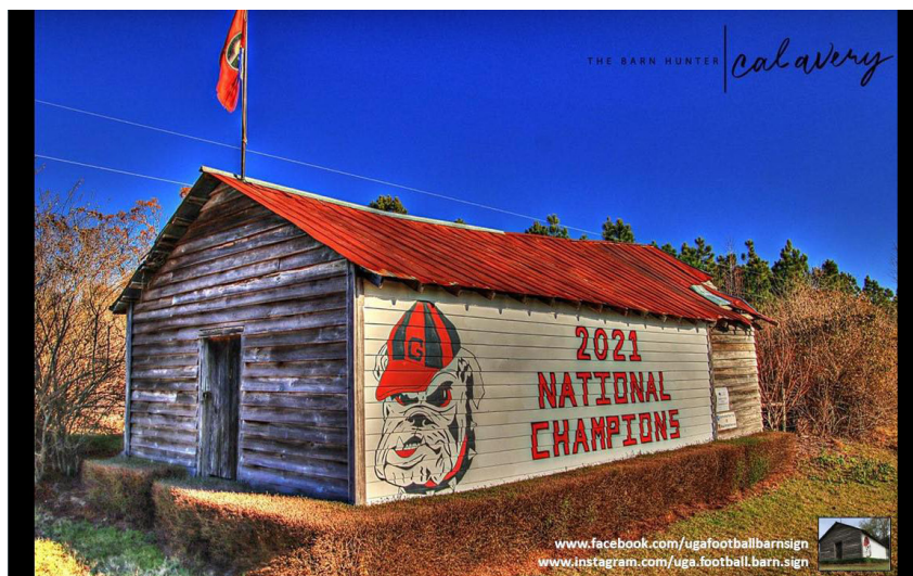
The barn was repainted on January 12, 2022, as a tribute to the Georgia Bulldog's win against Alabama.